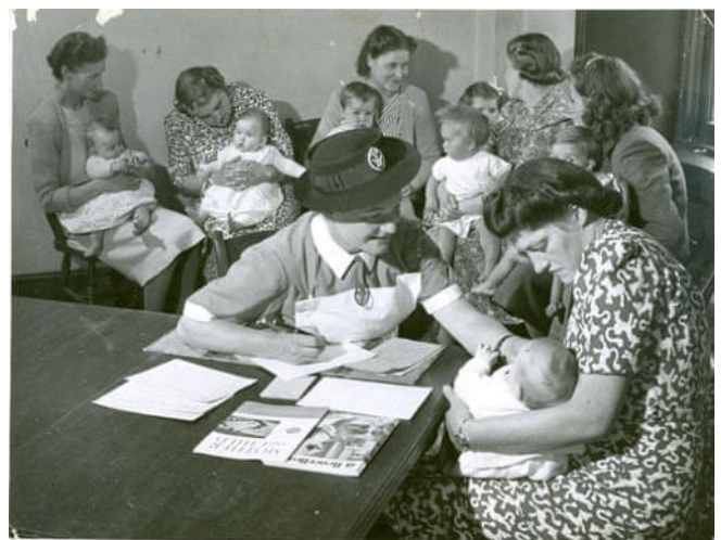
District Nurse at the baby clinic