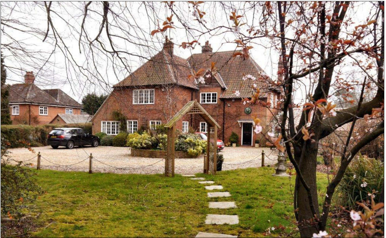
Bradesfield, Blofield Road as it is today